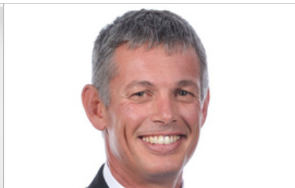
Nico Muller , Impala Platinum (CEO)