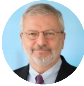
Joshua Bolten President & CEO (/about-us/staff/joshua-bolten-president-ceo).