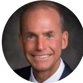
Dennis A. Muilenburg

(/about-us/members/larry-j-merlo-president-and-chief-executive-officer-cvs-health)