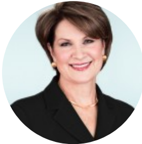
Marillyn A. Hewson